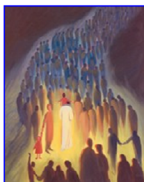
CHRIST AMONGST HIS PEOPLE

Who Are They - Catechumen or Candidate? What's the difference?